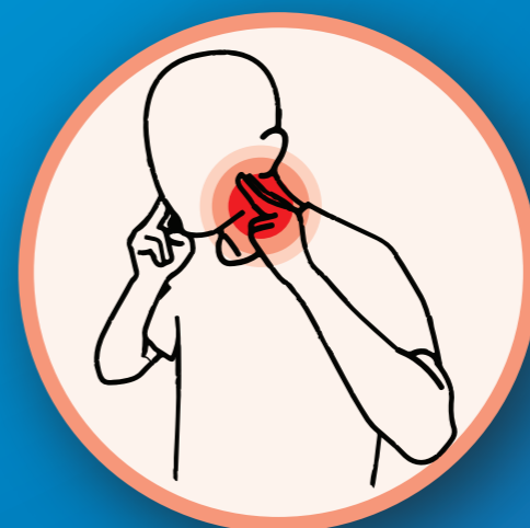
Swollen Lymph Nodes

If you experience any of these symptoms, seek urgent medical attention.